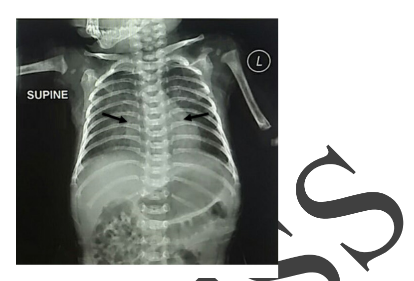
Figure 2. The chest x-ray of the proband (V-4) at 3 months of age indicated the milliary pattern in both lung fields. The arrows indicate the position of hila and lung congestion.