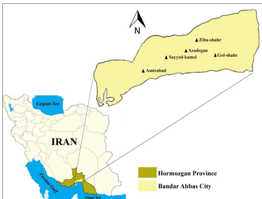
Figure 1. Map of Iran showing Hormozgan province, Bandar Abbas city, and regions in which the species and prevalence of house dust mites were evaluated in kindergartens